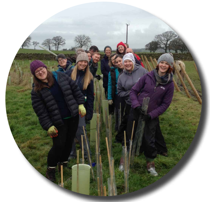
Our staff actively take part in tree planting and other project-led activities