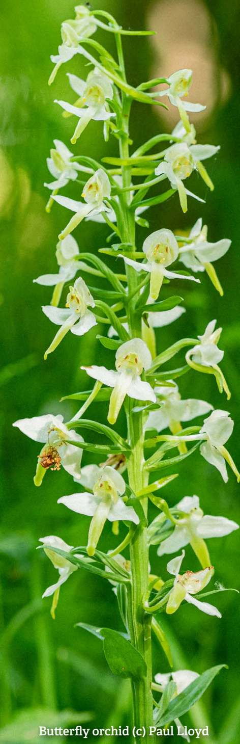
Butterfly orchid