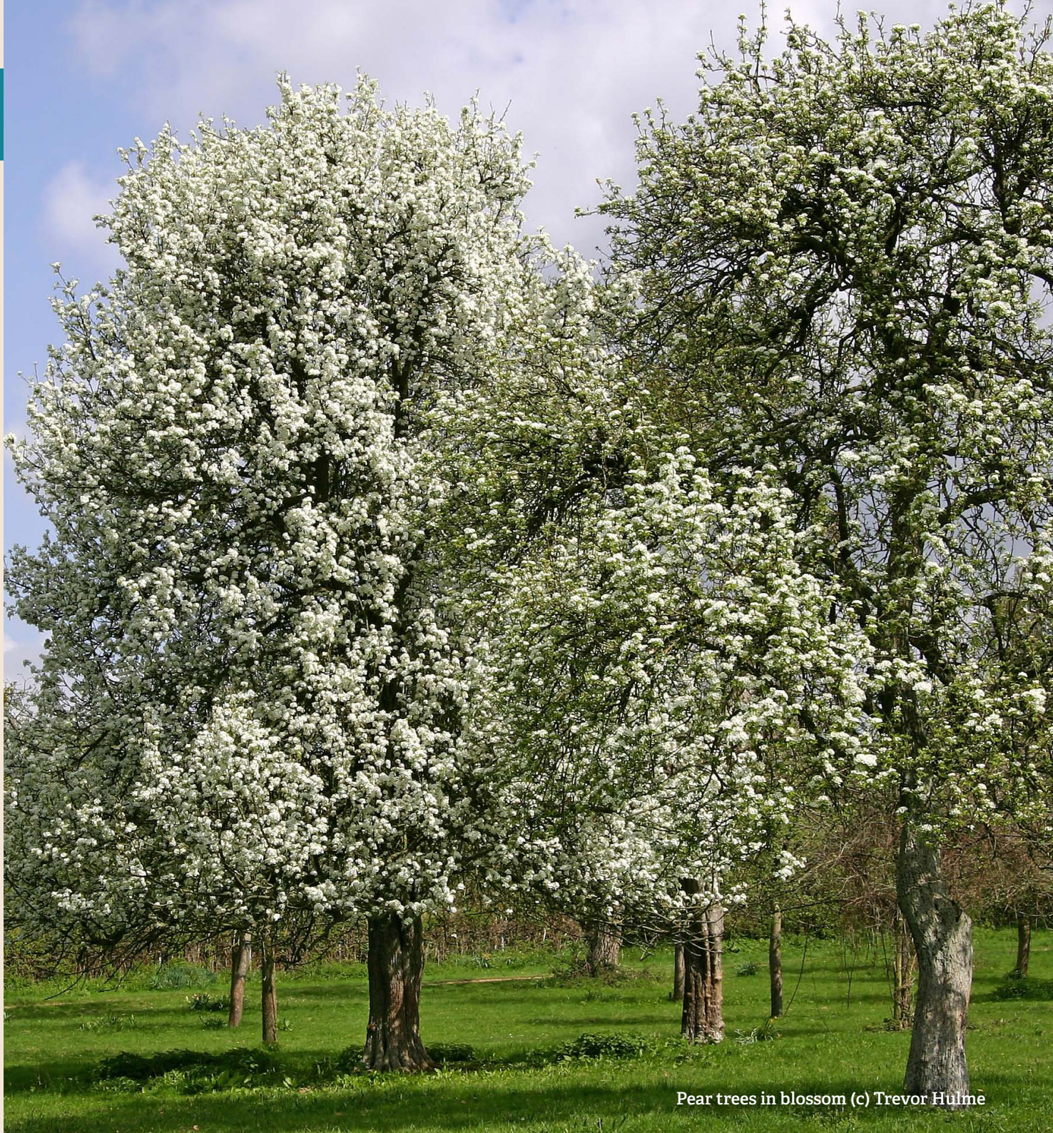
Pear trees in blossom