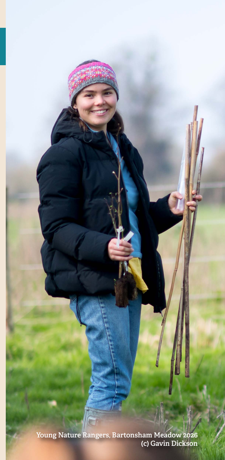
Young Nature Rangers, Bartonsham Meadow 2026

Finances: our annual income is about £3 million. About one third of this comes from grants for specific projects. Our commercial income is about £0.9 million. Membership income, donations, appeals and the occasional legacy comprise most of the balance. A copy of our most recent audited accounts is available at https://www.herefordshirewt.org/what-we-do/publications/annual-reports