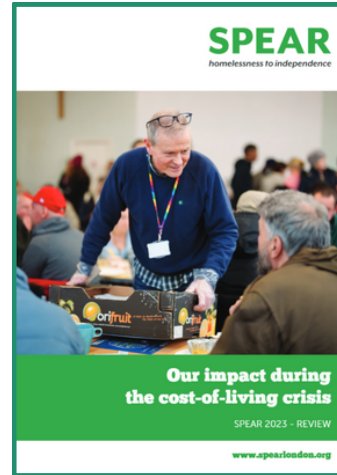
2022/2023 Impact Report

You can find more information about SPEAR on our website here .