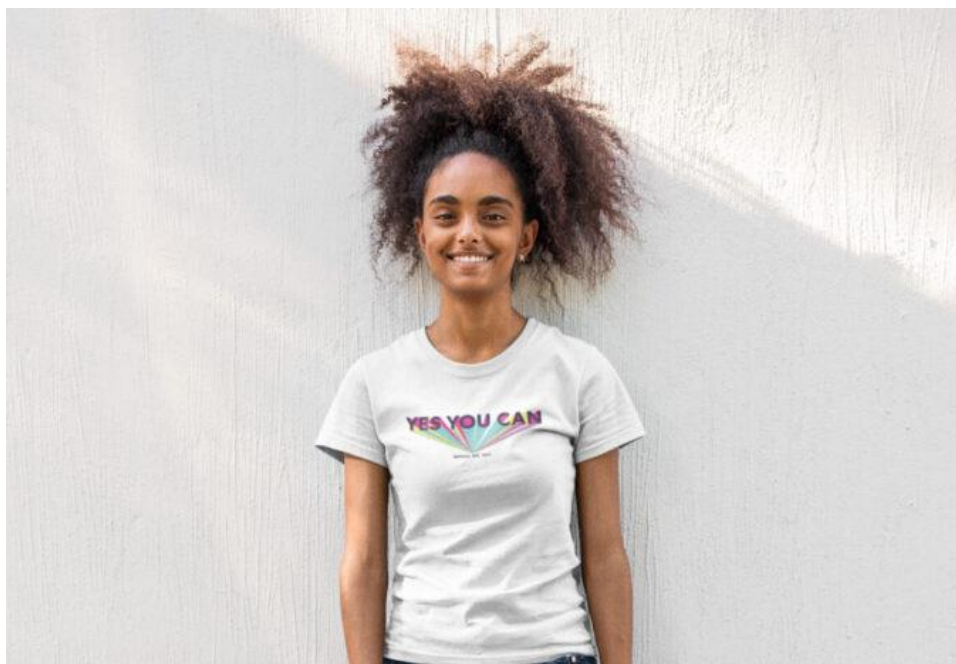
Service Manager Applicant Information Pack

For women and children. Against domestic violence.