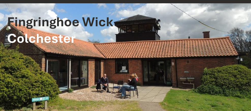
Fingringhoe Wick Colchester