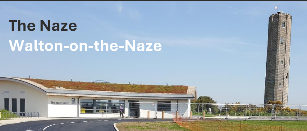
The Naze Walton-on-the-Naze