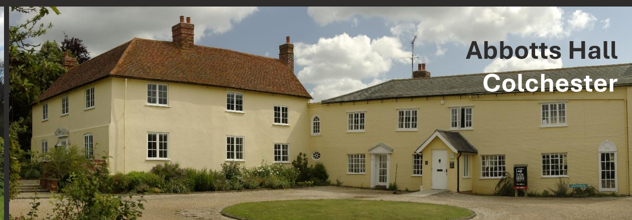
Abbotts Hall Colchester