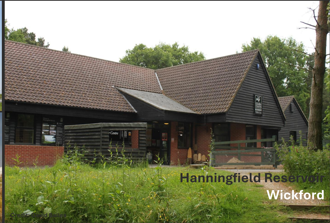
Hanningfield Reservoir Wickford