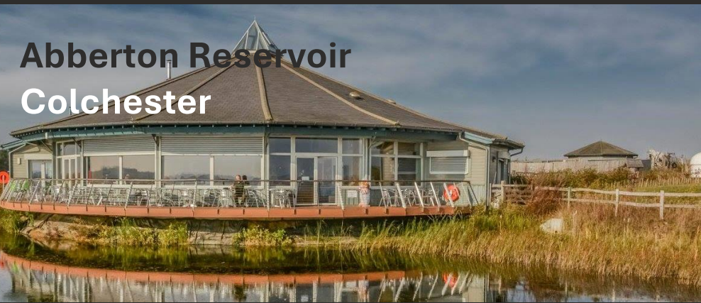
Abberton Reservoir Colchester