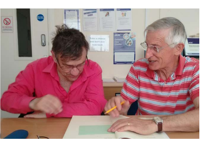
So, why are we looking for a new Chair?

I have had the privilege of holding the Chair role during that period of transition from Founder to CEO, drawing upon my intimate knowledge as a long-term volunteer with Read Easy, as a group Team Leader and reading coach.