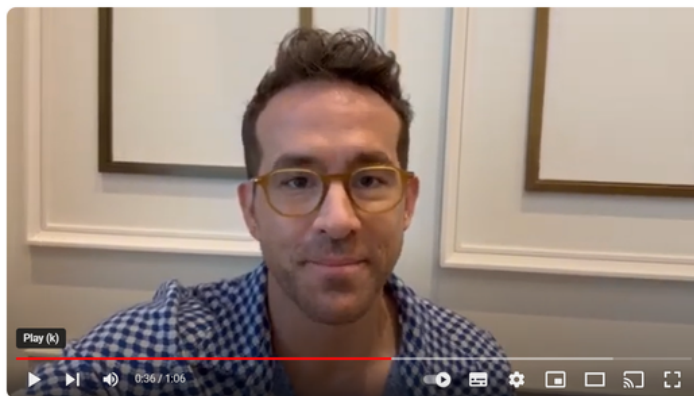
Community Foundation Wales Philanthropy Award 2024 winners - Ryan Reynolds and Rob McElhenney Community Foundat... 21 subscribers Analytics Edit video 3 likes Share Download