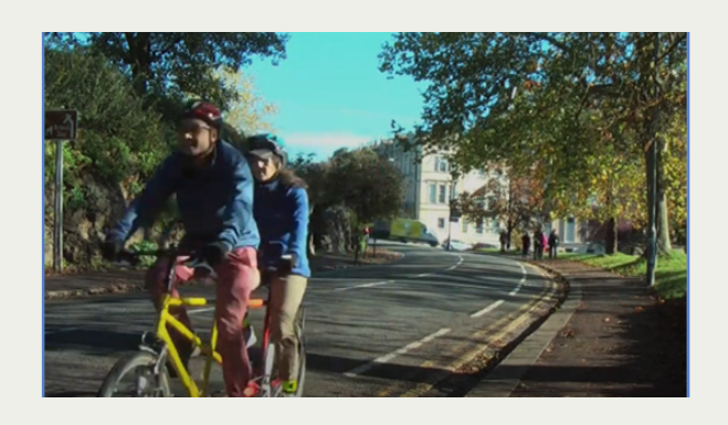
<u>Tandem cycling for the visualy impaired</u> <u>"Two's Company"</u>