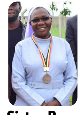
Sister Rose Mbale School for the Deaf

We are asking that you please come back and support us and other schools and community centres in our area."