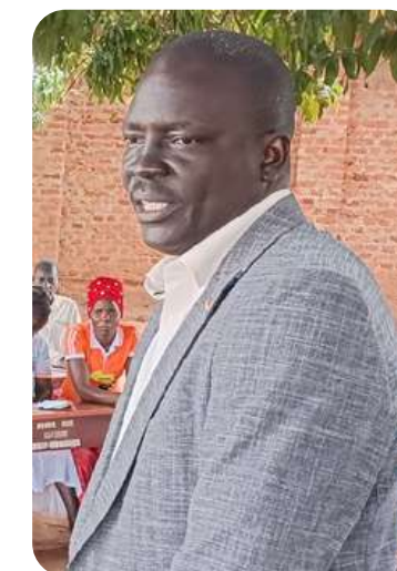
District Education Officer Bukedea District

This pit latrine is very innovative. Now we have good sanitation, we can prioritise education. These are the best facilities I have seen in all of Uganda. They can last many years."