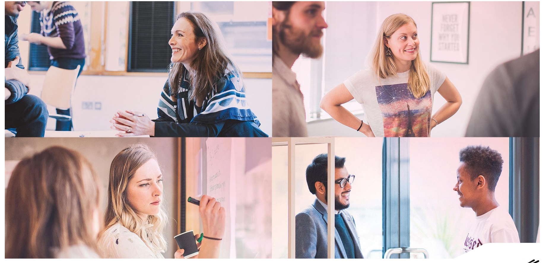
Director of Finance and Strategy (maternity cover)