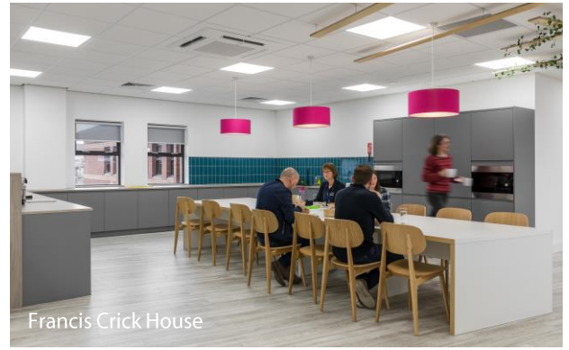
Francis Crick House

We also have an office space in London, which is used predominately by our External Affairs Team. Some of our staff are based regionally and work from home.