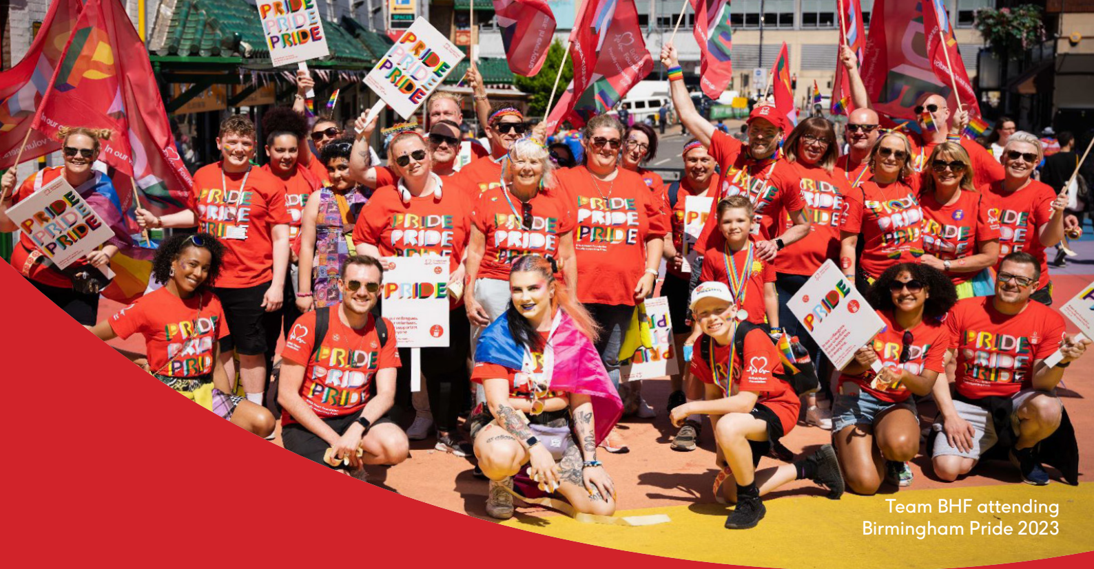
Team BHF attending Birmingham Pride 2023