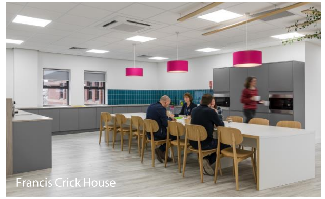
Francis Crick House

We also have an office space in London, which is used predominately by our External Affairs Team. Some of our staff are based regionally and work from home.