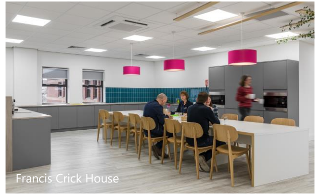
Francis Crick House

We also have an office space in London, which is used predominately by our External Affairs Team. Some of our staff are based regionally and work from home.