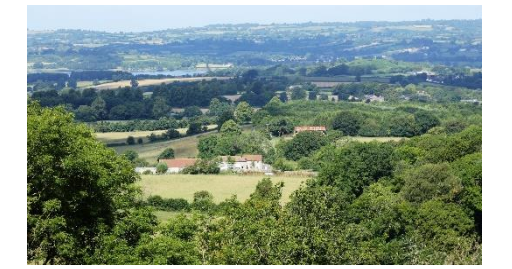
"Inspiring support from donors and funders"

Fundraising underpins everything we do as a charity. We are fortunate to have a strong membership base supporting our work and a range of trusts, foundations and grant-making bodies funding projects to engage people and restore wildlife. We have ambitious plans underway, including: