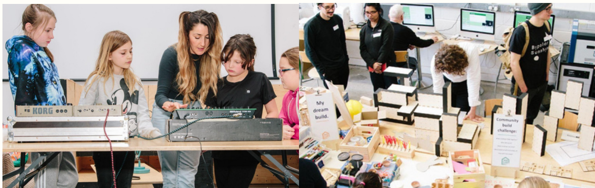
Soundwaves young people's programmes and KWMC: Factory, Making Together Day.

We ensure our programmes are rooted in community priorities by working closely with, and as founding members of, the Knowle West Alliance. From our purpose built community tech eco-building (KWMC: Leinster Ave) and our digital maker space (KWMC:Factory) we run regular arts+tech capacity building and co-creation programmes for all ages.