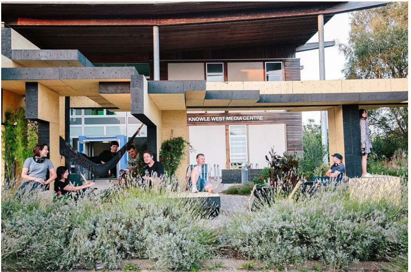
KWMC building and BlockWest Pavilion.

If you require this application pack in an alternative format, please email michaela@kwmc.org.uk or call us on 0117 903 0444.