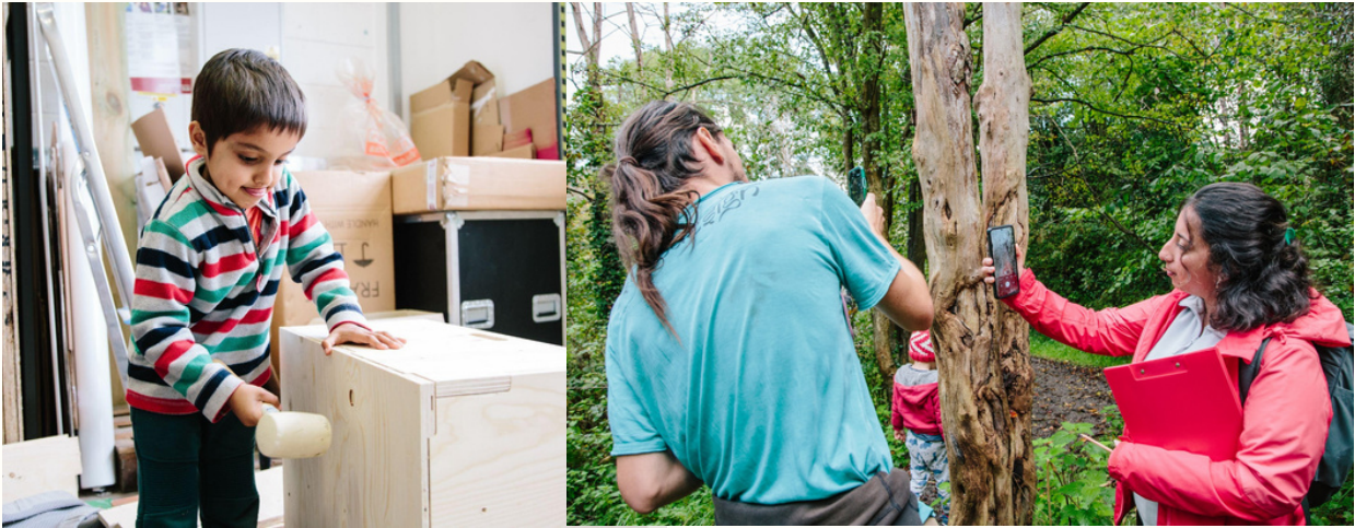
KWMC Factory Making Day and Citizen Science activity.

Our programmes range from regular after school social action and digital fabrication sessions for young people to artist residencies, neighbourhood science projects, international research projects and more.