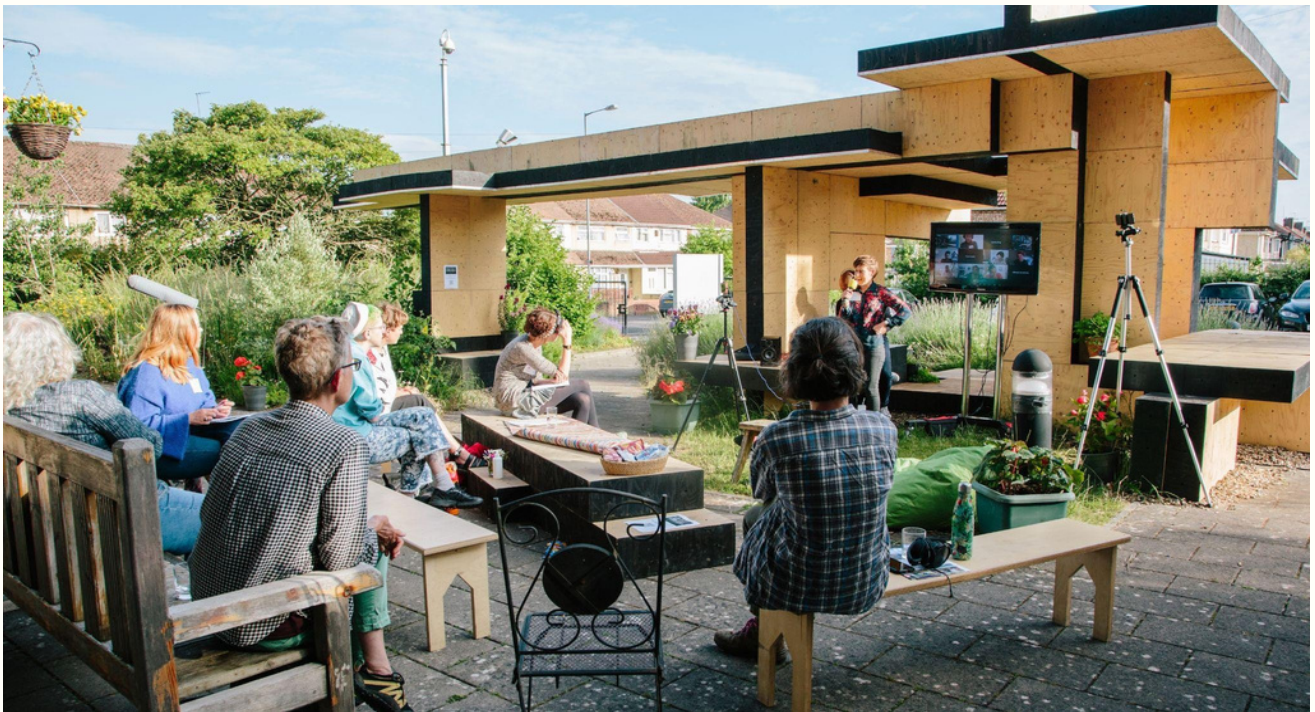
BlockWest Pavilion outside KWMC.