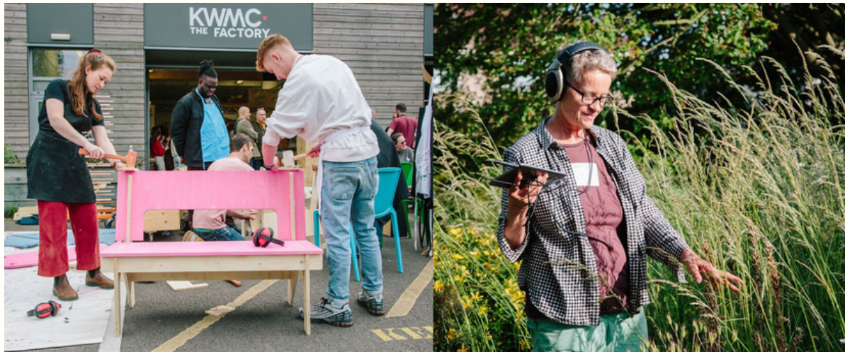
Retrofit Reimagined Festival, KWMC: Factory and Audio experience participant.

We have been working in and with our local community since 1996. We work across the neighbourhood in green spaces, high streets and homes, bringing our arts, tech and co-creation practices into a local ecology of change making.