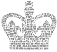
Queen Elizabeth II Platinum Jubilee Volunteering Award